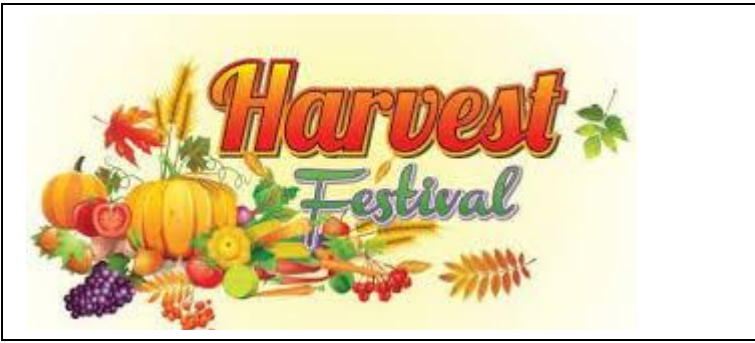
ACC Harvest Festival 2020

ACC gave thanks to God for all His Bounty with our annual Harvest Festival.